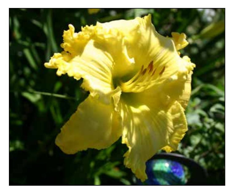
H.'Spacecoast Irish Illumination' (Kinnebrew-J. 2008)