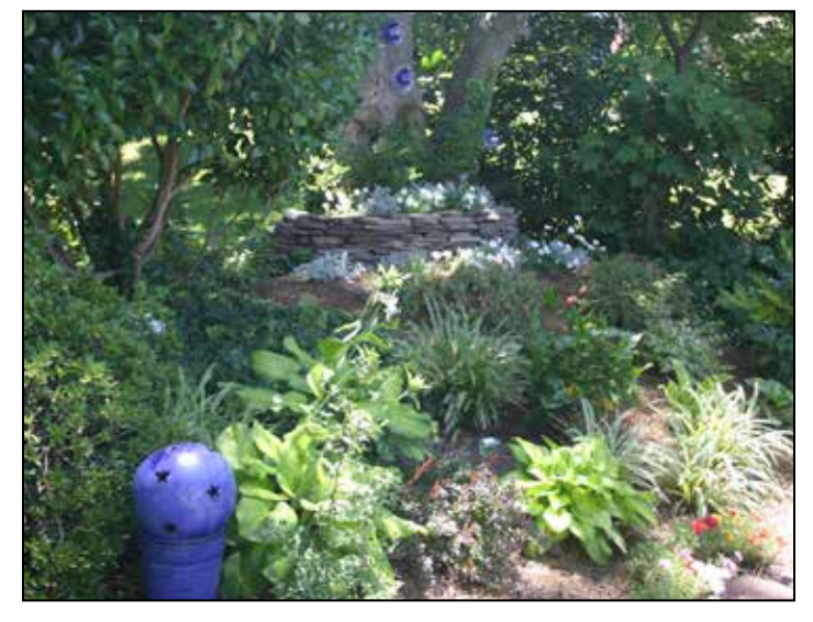
A shady portion of Linda's back yard