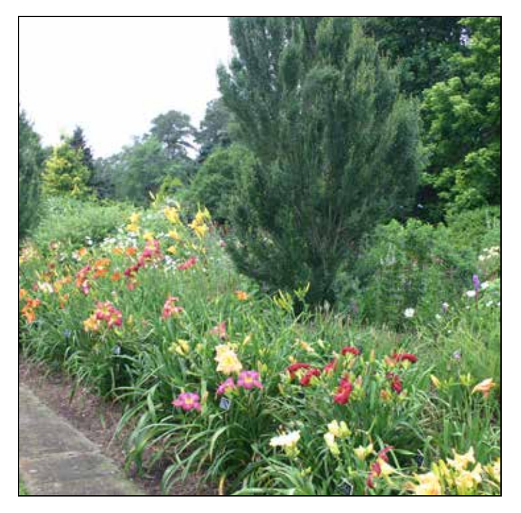
A portion of the Dan Tau Seedling Bed

Fortunately, despite a little misty rain now setting in, I had been able to get a few shots of some of the many clumps of daylilies, as well as some individual blooms, when I first arrived. So I was happy.