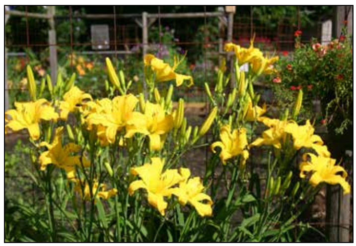
H. 'Tidewater Elf' (Holmes-S. 2012)

Perhaps the most impressive clump in the Sweetland garden was a planting of H . 'Tidewater Elf' (Holmes-S. 2012). The numerous blooms open on the day of our tour helped it to garner the 2017 President's Cup, awarded to the most impressive clump seen in a tour garden. But this 5" clear golden yellow tetraploid with lightly ruffled petals and a touch of tangerine on its sepals was beautiful in several gardens. I counted eighteen blooms open, but there may have been more.