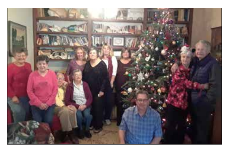
Group photo at club Christmas party