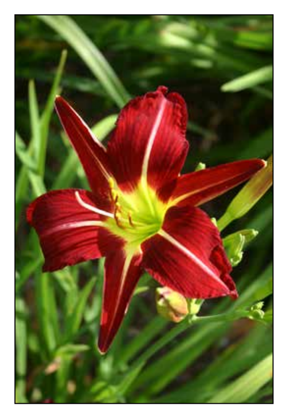
H. 'July Four' (Wynne)