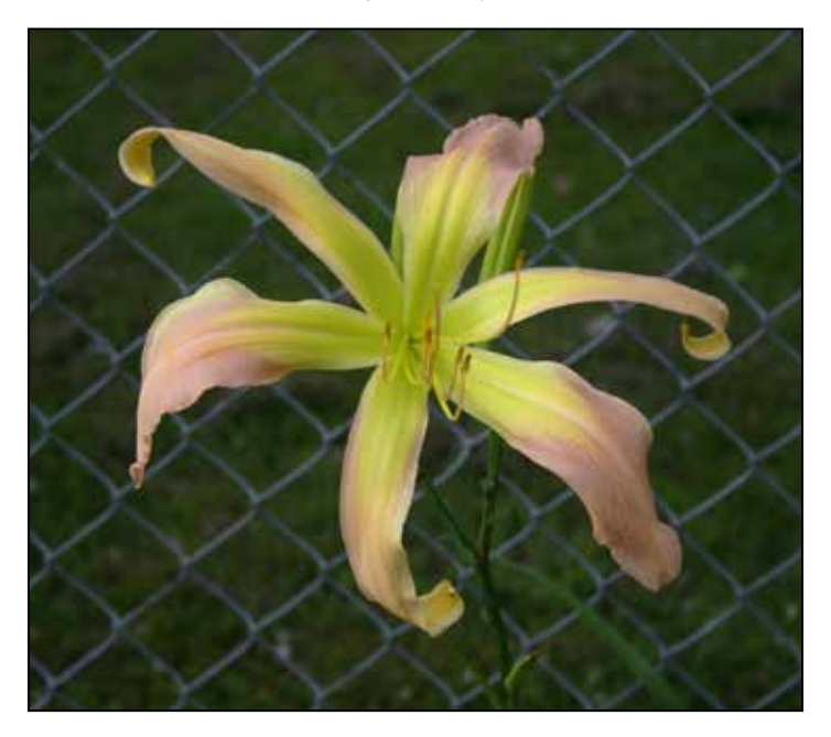
H. 'Wanda Evans' (Holmes-S. 2009)

The fifth garden on our tour was Feistel's Folly, the garden of Greg and Dianna Feistel. This young couple had graciously offered to host regional beds for all of the fifteen Regions in AHS. A large portion of an entire lawn had been set aside to accommodate these beds. About 200 cultivars sent by Regions 1, 2, 3, 4, 5, 8, 10, 11, 13, 14, and 15 were superbly grown. Each Region approached the offer differently. Region 13, for example, sent their Stout Medal winners and daylilies that historically have done well in their region, while Region 2 sent newer cultivars from many of their hybridizers. Region 14 chose to send cultivars largely