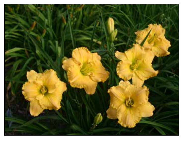
H. 'Empire Queen' (Carpenter-J. 2003)

Perhaps the most impressive clump in the Sweetland garden was a planting of H . 'Tidewater Elf' (Holmes-S. 2012). The numerous blooms open on the day of our tour helped it to garner the 2017 President's Cup, awarded to the most impressive clump seen in a tour garden. But this 5" clear golden yellow tetraploid with lightly ruffled petals and a touch of tangerine on its sepals was beautiful in several gardens. I counted eighteen blooms open, but there may have been more.