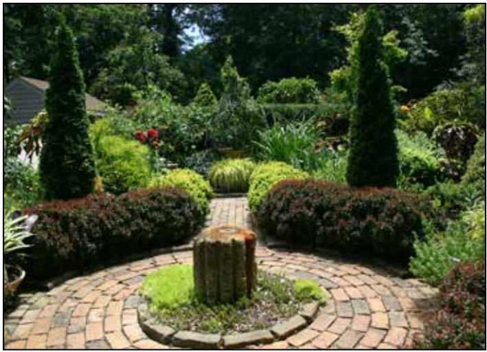
A circular brick walkway surrounds a columnar birdbath and continues on amidst shrubs in varying shades of purple and chartreuse.

Near the entrance to the Pinkham garden is a formal garden, the first of several garden rooms, featuring an exotic collection of shrubs, roses, grasses, and various other ornamental plants.