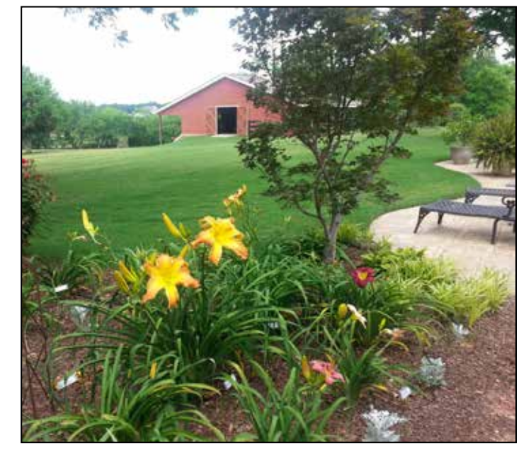
H. 'Curious George' ( Petit 2001 ) is one of Linda's favorite cultivars. Its extra large 9" burnt orange flowers with a gold edge above a green throat are borne on 30" scapes.

Linda's favorite daylily is Hemerocallis 'Curious George' (Peat 2001) and George's favorite is H . 'Jolly White Giant' (Ciavarelli 1984), both of which bloom all summer. Friends tell them to plant all 12 acres in daylilies, but the Carletons feel due to the care that daylilies require that the current plantings are just about right.