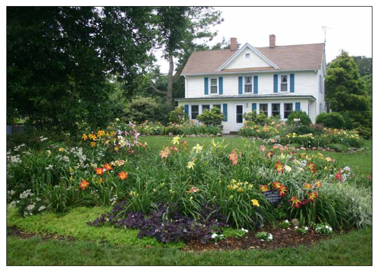
While the Sterrett garden is filled with ornamentals, perennials, annuals, and various bulbs to give color throughout the seasons, the emphasis is on daylilies. Theirs is an AHS Display Garden, featuring daylilies of all sizes and form.