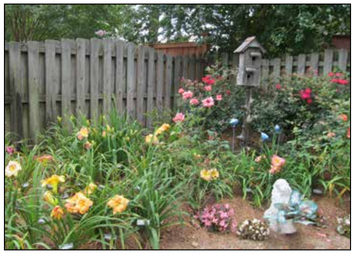
An attractive wooden fence borders much of the property. Nestled into one corner and set among Knockout roses is a birdhouse built by MADS' member, Arthur Woods. Daylilies abound.