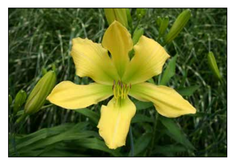
H. 'Dapper Flapper' (Burkey 2003)

as an unusual form spatulate. Margo Reed's 7" cream with a violet feathered eye is registered as an unusual form cascade. Its feathering appears to possess the lightest stippling effect.