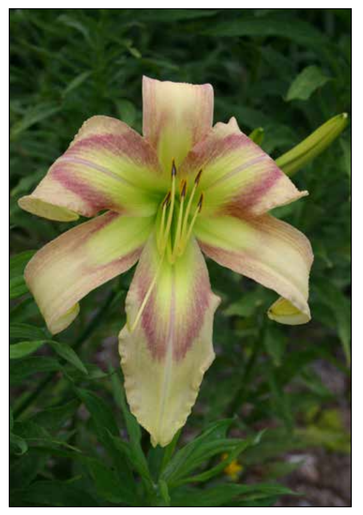
H. 'Jellyfish Jealousy' (Reed 1995)

In many ways, I think the Norfolk Botanical Garden indeed rivals some of the more prominent botanical gardens located throughout the United States.