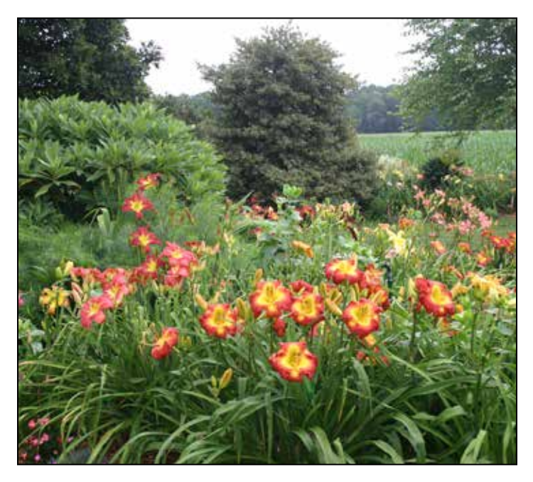
H. 'Annandale Plantation' ( Douglas-C. 2013 ), a coral red diploid with white midribs, and 'Forever Redeemed' ( Carpenter-J. 2003 ), a red tetraploid with large gold throat, make a striking combination.