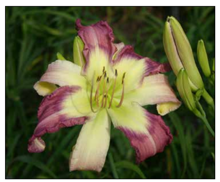
H. 'Octomom' (Cochenour 2009)

A special treat was the discovery of a single bloom of Pat Cochenour's H. 'Octomom' in the side yard leading to the back. The sun had come out, so I kept running back to catch it under a cloud. Finally I succeeded. More than one person kindly offered to stand in as a shadow, but I've found that for good photography, one needs natural light. Even a white umbrella tends to make the lighting a bit gray. 'Oc tomom' is typical of a newly emergent class of polymerous daylilies which bloom with more than the standard six segments. According to its registration data, this 6.5" lavender cream bicolor with a dark lavender eye blooms with eight segments 45% of the time. One will also notice the eight corresponding anthers.