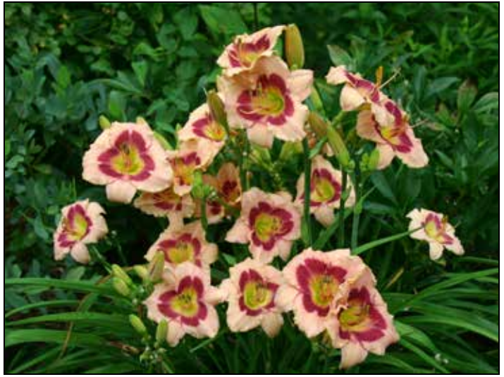
H. 'Wineberry Candy' (Stamile 1990)

One of the pleasing things about visiting a good botanical garden, is that you get to reacquaint yourself with old friends—daylilies that is. If you attend a National Convention, you also renew your human friendships as well.