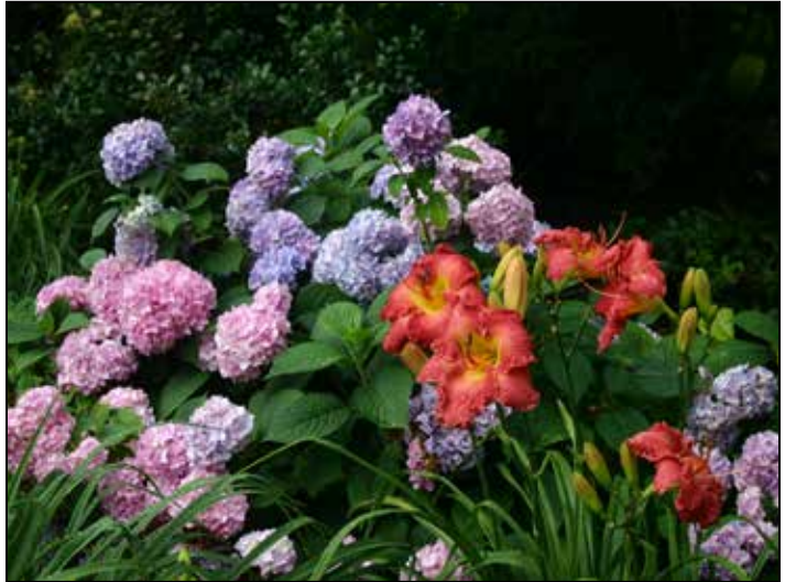
The Sterrett garden featured colorful groupings, such as these delicate rose and lavender hydrangeas serving as a backdrop for the sultry rose coral tetraploid, H. 'Wall of Fire' (Emmerich 2008).

After we left Norfolk, it had rained here and there more heavily, but not enough to damage the flowers. Still, most of the ones I shot had raindrops.