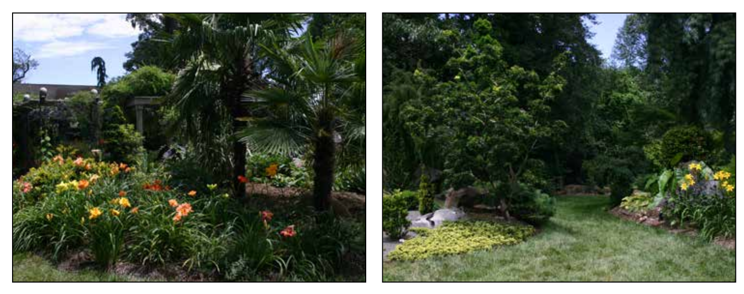
An almost tropical setting for double daylilies

Although I featured this photo on the back cover of the 2017 Spring/Fall issue of The Dixie Daylily , I wanted to include it here for others to see. I'm very proud I had the opportunity to take this photo, and for it I must express my thanks to the Pinkhams' impeccable artistry.