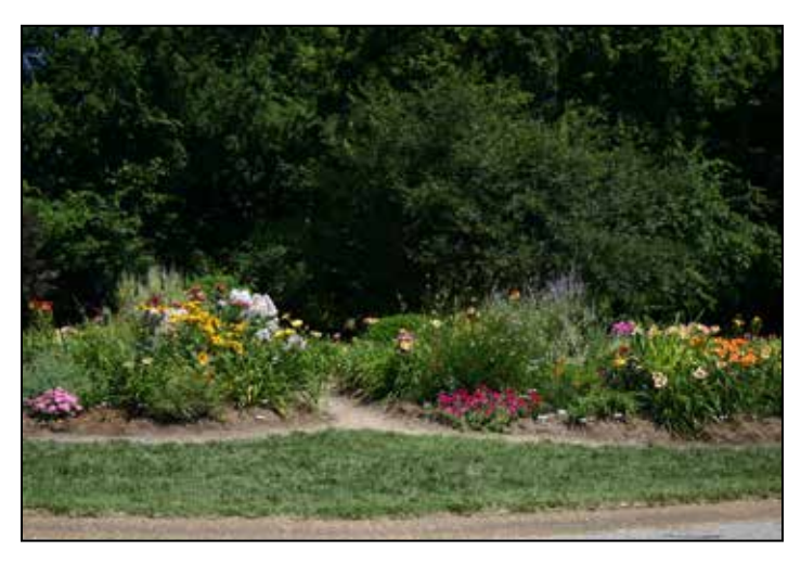
Lissa Cash's front yard

In Lissa's wooded back yard, she had planted numerous shade plants along a small creek bed. Interspersed among these in spots of sunlight were more daylilies.