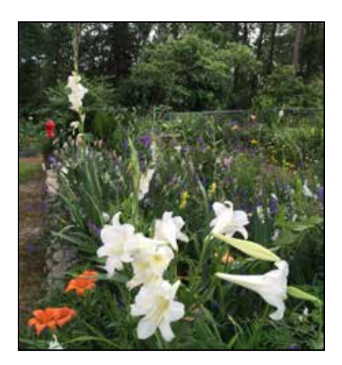
Rita Moore's Garden with Easter lilies and other early spring flowers

Hope you will consider showing with us. Just have your entries there by 8:00 A.M. for a fun filed day.