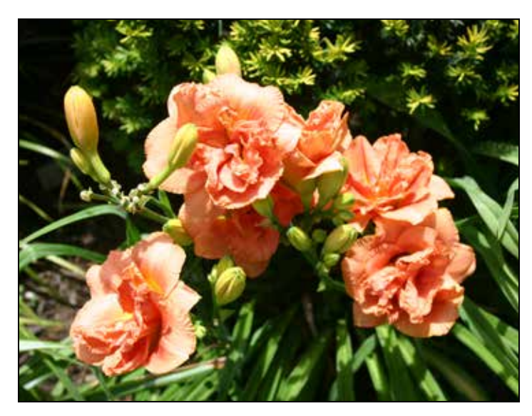
H. 'Micro Dots' (Trimmer-J. 2003)

As one turns and looks back across the grassy lawn which borders the Asian venue, one sees a beautiful planting of double daylilies set amid what appears to be an almost tropical setting.