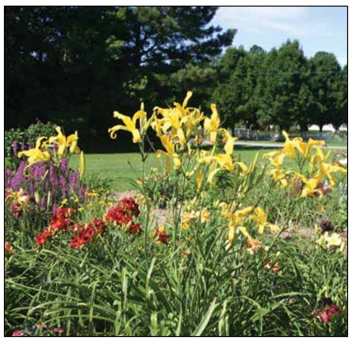
The visual centerpiece for the Region 14 display bed turned out to be Terah George's H. 'Banana Smoothie' (2006). Its imposing height at 64" certainly caught the attention of garden visitors.

several of the prominent hybridizers in our region actively hybridizing at present. Two cultivars, in particular, stood out. H . 'Double Blue Blood' (George-T. 2005), a 99% double tetraploid 5.5" blood red self, displayed a large number of blooms, and was one of the runners-up for the Georgia Doubles Appreciation Award. It is registered at 26" tall. On the other hand, 'Banana Smoothie' (George-T. 2006), a 64" tall, unusual form crispate tetraploid, sported its 10" yellow blooms against the brilliant blue sky. So commanding was this giant, that it garnered the Ned Roberts Spider/Unusual Form Award. Needless to say, I spent a lot of time enjoying how well the daylilies from Region 14 were flourishing.