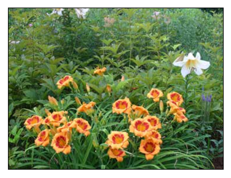
H. 'You Are My Sunshine' ( Herr-D. 2000) is a 4" yellow gold tetraploid with a red eye and edge. It received my vote for the Florida Sunshine Cup, given to the best miniature or small flower seen in clump strength. Its setting amidst companion plants was lovely.

One of the nicest aspects of the perennial garden was that there were not only modern daylilies, but several classics, including one very famous species. The Norfolk Botanical Garden had one of the largest clumps of H. citrina