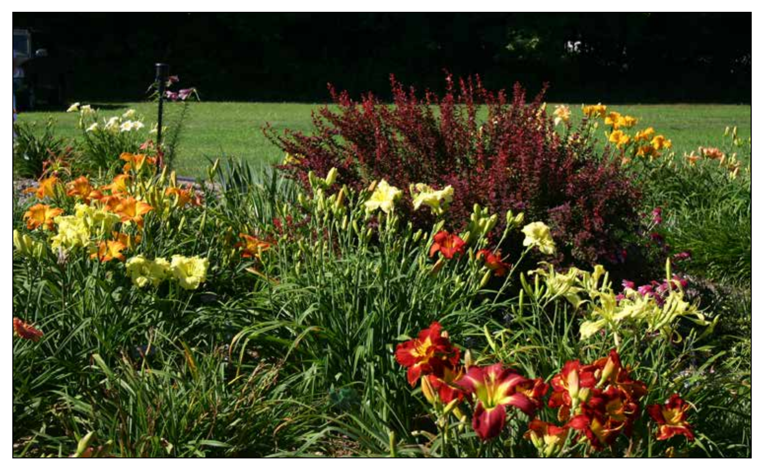
In front of Greg and Dianna Feistel's home stretches an expansive green lawn. Large beds like the one pictured contained a mixture of daylilies amid an assortment of companion plants.