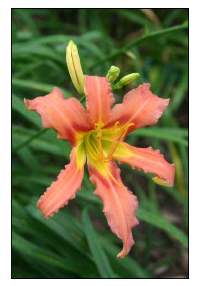
H. 'Coral Crab' (Douglas-G. 1954)

than I had imagined. I would say it was about 3.5" in bloom size, although no size is generally listed for daylilies on the AHS website prior to 1963.