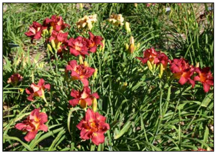
H. 'Double Blue Blood' (George-T. 2005)

H. 'Double Blue Blood' is an immensely popular daylily in Region 14, having topped its Popularity Poll on more than one occasion.