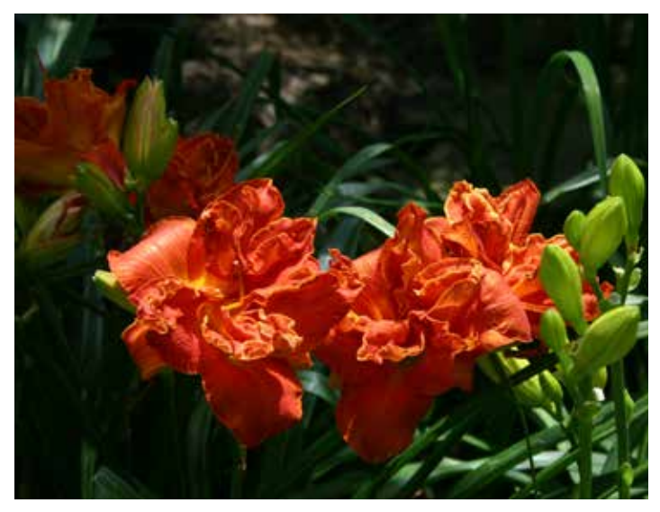
H. 'Moses' Fire' (Joiner 1998)

Two of these doubles were H . 'Micro Dots' (Trimmer-J. 2003), a 2.87" miniature cantaloupe diploid (blooms are much smaller than the close-up implies), and 'Moses' Fire' (Joiner 1998), a 6" red tetraploid.