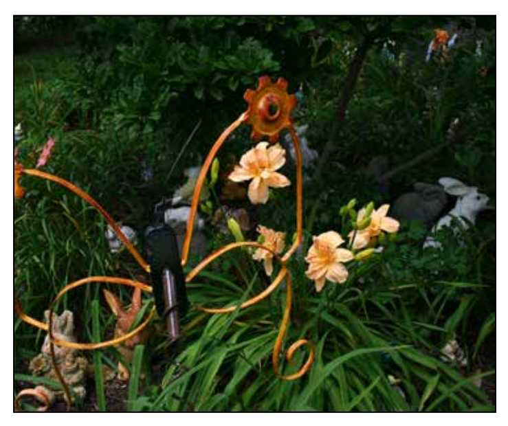
H. 'Scatterbrain' (Joiner 1988), a light peach pink diploid double, was blooming in the midst of what appeared to be some sort of rustic insect surrounded by bunnies too numerous to count.

The third garden we visited was that of Eileen and Joe Walsh, located in suburban Virginia Beach. The Walsh garden features not only daylilies, but an assortment of quirky art.