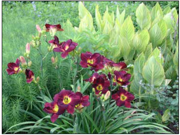
H. 'Goodnight Lucy' (Bunting 2009)

Two of the prettiest individual blooms I photographed were by Region 3 hybridizers: H. 'Dapper Flap per' (Burkey 2003) and 'Jellyfish Jealousy' (Reed 1995). Clayton Burkey's bright golden yellow cultivar is registered