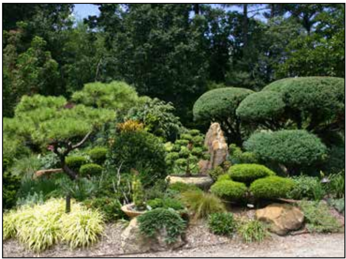
An Asian-like area in the Pinkham garden

Directly across the driveway is another garden room, featuring an impressive display of bonsai-like plants, stones, and grasses typical of an Asian venue.