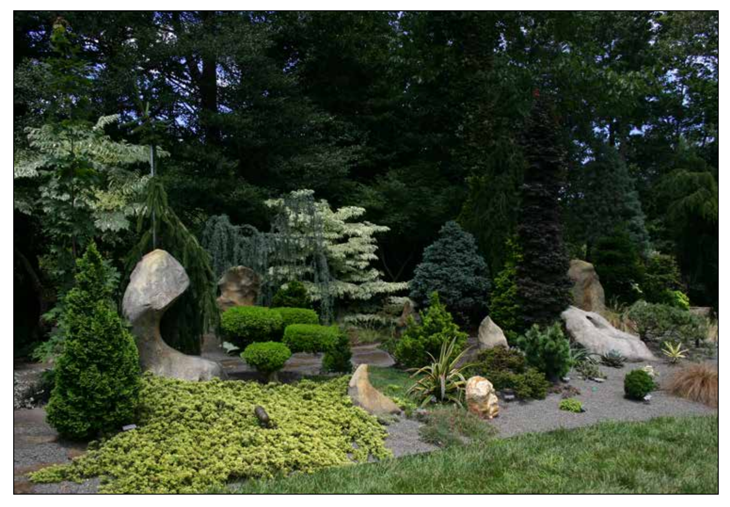
The excellence of design in this Asian venue

As one turns and looks back across the grassy lawn which borders the Asian venue, one sees a beautiful planting of double daylilies set amid what appears to be an almost tropical setting.